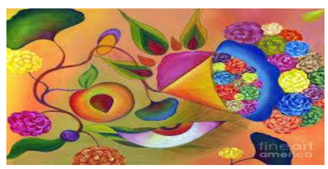
Breakthrough Conversation: by Rachelle Lamb