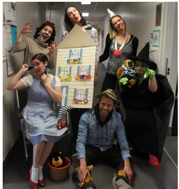
VEQ team Halloween Costume: Wizard of Oz

In addition, Voice of English-speaking Québec would like to thank everyone who voted on our Halloween theme this year!