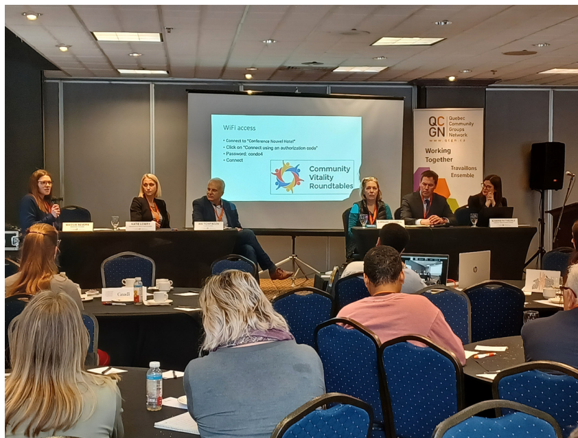
Chairs of four priority community tables present main concerns and priorities highlighted by members of each roundtable.

The following week on March 10, we attended a one-day event organized by the Quebec Community Groups Network (QCGN) on the Community Vitality Plan - an action plan highlighting the set of priorities that were identified by the English-speaking community. Four roundtables, made up of representatives of various English-speaking organizations, have been meeting regularly since 2021 to discuss four areas of priority for the English-speaking community: Data, Organization Health, Representation and Funding. SAQ is a member of the Funding table. It was an informative day and we will share more information as it becomes available.