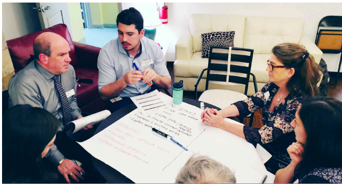
One of the teams during their brainstorm.