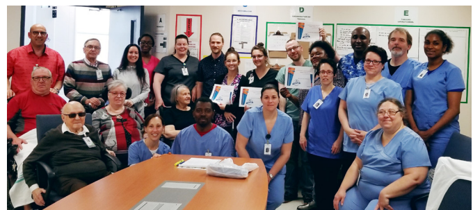
The Jeffery Hale is one of the region's long-term care facilities that was targeted by the FAMT project. (Photo of the first student cohort)

A bilingual version of the FAMT project is currently being developed by the Eastern Quebec Learning Centre. The goal is to include facilities in the region where the majority of clients are English speakers. The first cohort is expected to start in early 2020.