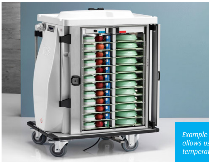
Example of a Burlodge distribution cart, which allows us to keep the clientele's food at the correct temperature while it is being distributed.

The Commissioner would like to thank everyone who