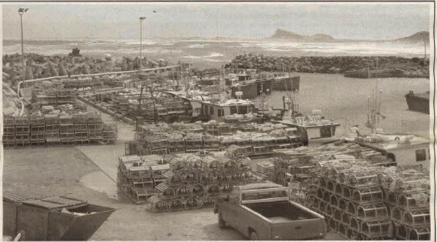
Grosse Isle Harbour, May 8 th , 2004 - Fishermen on hold waiting to set their traps.

To everyone working in the fishing industry, we wish you a safe and prosperous season!