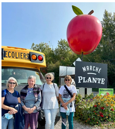
Marché Plante at Île d'Orléans

September and October were full of outings and benefited over 150 participants!