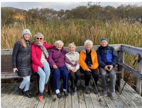
Cap Tourmente National Wildlife reserve

Fall is in full swing with Out & About activities, and what a beautiful warm fall we have had!