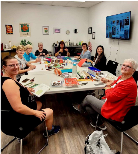
Paper quilling activity in Shannon