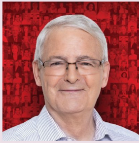
A Q&A with Marc Garneau, Liberal Candidate for NDG- Westmount