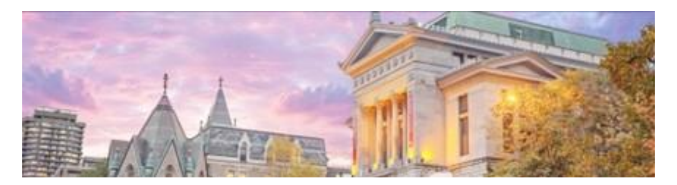
MCLL's Voices of Lifelong Learners showcases short videos of compelling stories from MCLL members: remarkable life stories, amusing anecdotes and social contributions to inspire the next generations: <u>Click here</u>