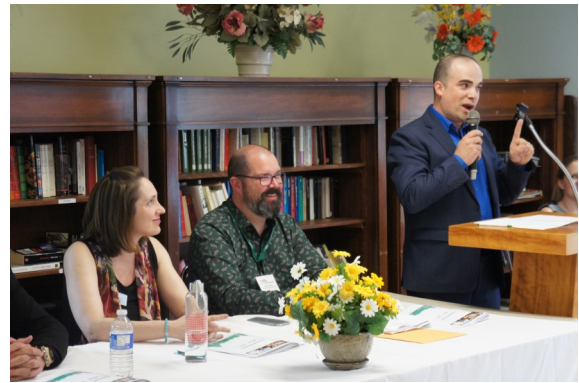
Annual General Meeting 2017

had the chance to hear about VEQ's successes in the past year and learn about many exciting new initiatives. VEQ was fortunate to have a number of interested community members wishing to join its board of directors. After short presentations from each candidate, the membership acclaimed 2 new board members and 2 current board members to continue for a second term.