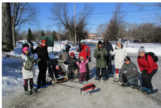
Newcomers Snowshoe Excursion