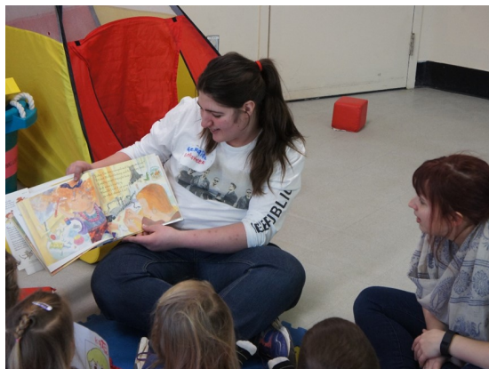
Take-A-Break Drop In Program

VEQ worked with Jeffery Hale Community Partners on their Take-a-Break Drop in Program. This activity allows parents to drop off their preschool children with caring volunteers and take a break while their children play. It occurs twice a month on Friday mornings from 9:30 A.M. until 11:30 A.M during the school year. Volunteers entertain children 2 to 5 years old, while babies are welcome to stay with the parents. This year 10 sessions were held with approximately 90 children attending, and we are so proud of the 30 volunteers for their dedication and patience throughout the duration of the program.