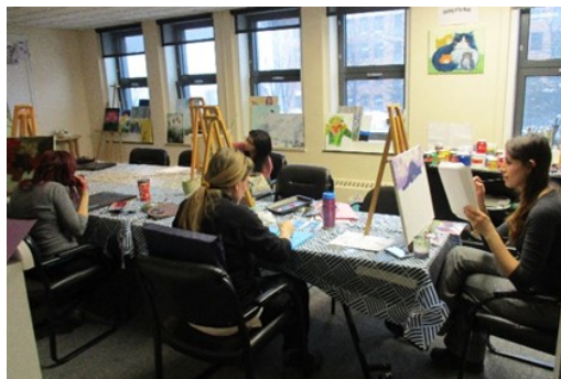
Newcomers Creative Corner

with other newcomers while painting. We had a lovely group of participants and overall it was a great success.