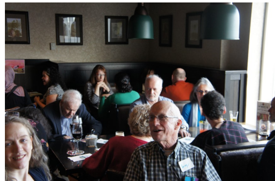
Spring Fest Book Launch 2018