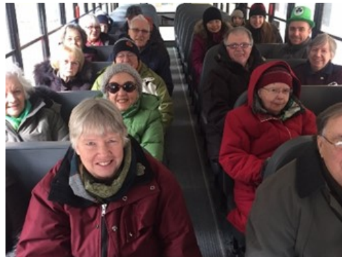
Seniors Out & About Bus