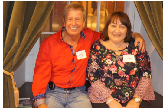
Holiday Happy Hour 2017

On March 28, 2018 VEQ hosted a Spring Fest Book Launch to help celebrate the culmination of two great projects— Connect with your City and Tell me a Story/Raconte-moi une histoire . Over 80 community members joined VEQ at Les 3 Brasseurs to enjoy learning about these projects and take home their own free copies of the books.