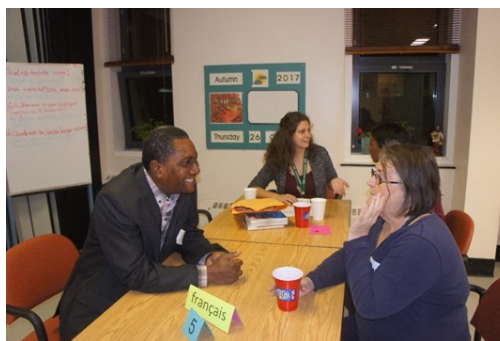
Language Exchange Café