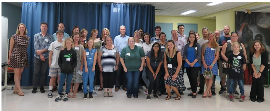
Newcomers Meet and Greet: Taste of Québec