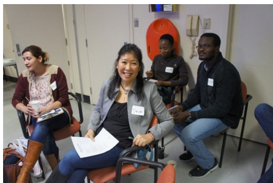
Winds of Change Workshop

held in partnership with Jeffery Hale Community Services to provide newcomers with information and tools on how to adapt to life in Québec. It was a great event to meet other newcomers and to learn a little about how change impacts our lives and what methods can be used to overcome the hurdles and challenges of living in a new environment. Thank you to all the participants, our guest speaker and to Jeffery Hale Community Services.