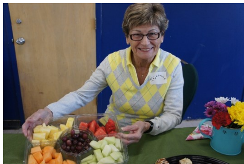
Game Night Gala 2017

Be Active Québec would like to thank all its partners for their tremendous support of BAQ's events and activities throughout the year. With their help, we were able to contribute to fun, engaging activities that promoted healthy lifestyle choices in the English-speaking community for young and less young alike. We look forward to continuing our partnerships and offering support to our community in the new year.