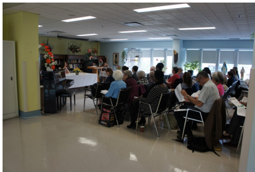
Annual General Meeting 2017

Over 60 people attended Voice of English-speaking Québec's 36th Annual General Meeting held on May 25, 2017 in the Coin Soleil at Jeffery Hale Hospital. Members