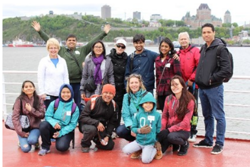
Newcomers Walking Tour

year that we offered a ferry ride as part of the tour and it was a well appreciated addition. This was a great way to finish the day and to get a fantastic view of the city at the same time.