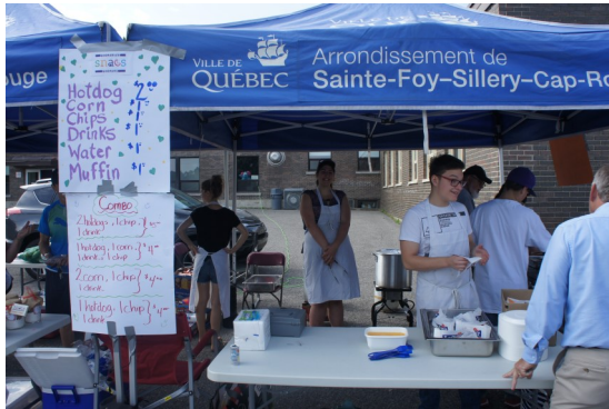
Fall Fest 2017