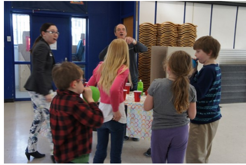
Game Night Gala 2017

BAQ actively participated in many community programs such as Travellin' Toddler Time (TTT) and Take-a-Break Time (TAB) by promoting the activities, coordinating volunteers, and offering support. We were even able to bring in an elf from the North Pole, Fiddlesticks, in order to help with the TTT Christmas Party! BAQ also hosted a variety of events for March Break: A Move-a-Thon Competition, a Fun with Food activity where kids and their parents played games to learn about living a balanced lifestyle, and Super YOU, a workshop on developing self-esteem. Approximately 40 children and their families attended these events, many of which are already looking forward to next year's activities.