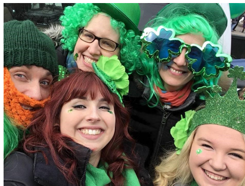
St. Patrick's Day Parade 2018

Once again this year, VEQ participated in the ninth edition of the Québec St. Patrick's Day Parade. VEQ staff and board members got decked out in green for the occasion and walked the nearly 5 kilometer route while handing out shamrock stickers to children. Thanks to Les Artisans du Paysage for loaning us a pickup truck to help spread the St. Patrick's Day cheer.