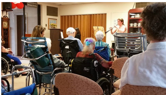
Seniors Out and About Concert at St. Brigid's Home

This project provides English-speaking seniors with free transportation to community activities and outings. The goal of this program is to reduce seniors' isolation while helping them to continue living autonomously. We take a small bus to their home, greet them with a smile at their door, and accompany them to the bus. It is heartwarming to see the amount of conversation and connection rise as each new participant joins us. This year there were 34 outings, and we brought together over 330 English-speaking seniors to do fun activities such as shopping trips to the mall, blueberry picking, visiting the île d'Orléans, and seeing The Philanthropist play.