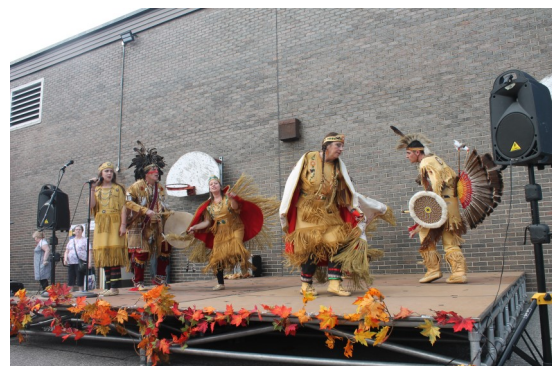
Sandokwa—Fall Fest 2017

Activity in the gym was buzzing with over 54 community groups and businesses showing the community who they are and what they do. SNACS catering provided a BBQ that kept the crowd fed while kids enjoyed face painting, and other great family activities. Thanks to our collaboration with Be Active Québec, the crowd was able to try out the smoothie bike. There were performances