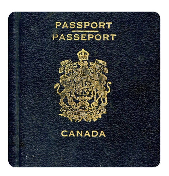
Check out the blog post