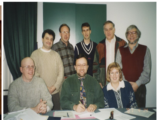
← Secretary of State