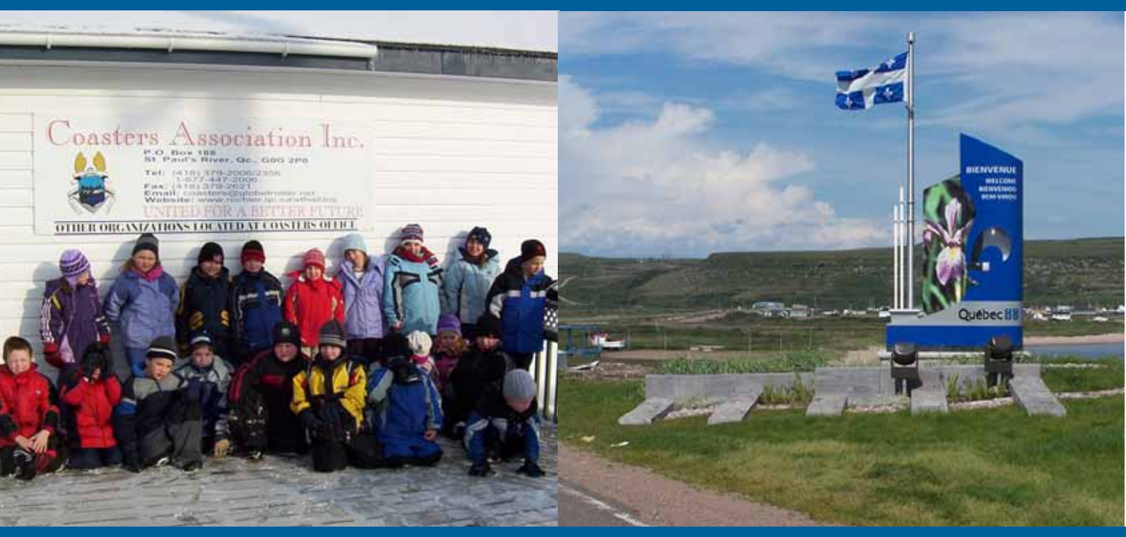
Connecting the Coast