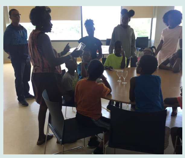
HAND IN HAND MEETING

At the heart of this project is the understanding that we must recognize, respect and appreciate the inherent strengths of each generation and the benefits to be derived when we remain connected and cohesive.