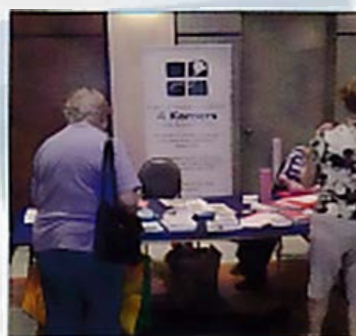
Information booth in Thérèse-de-Blainville