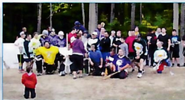
Lacrosse in Kanestake, sponsored by Québec en Forme Deux-Montagnes