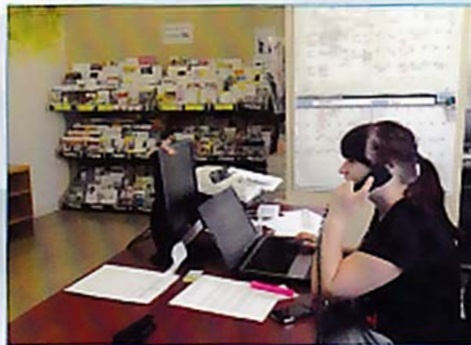
Helpful staff assisting members on the phone at the Head Office in Deux-Montagnes.

When services are not available in English, staff or volunteers work toward helping partners provide the service in English. When this is not possible, grants are sought to implement programs at one of the 4 Korners' offices.