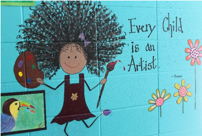
What a wonderful visit at Pierre Elliot Trudeau Elementary School in Vaudreuil on February 13th! Grade 3 students were treated to art classes with Deidre Potash of Artwill Studios.