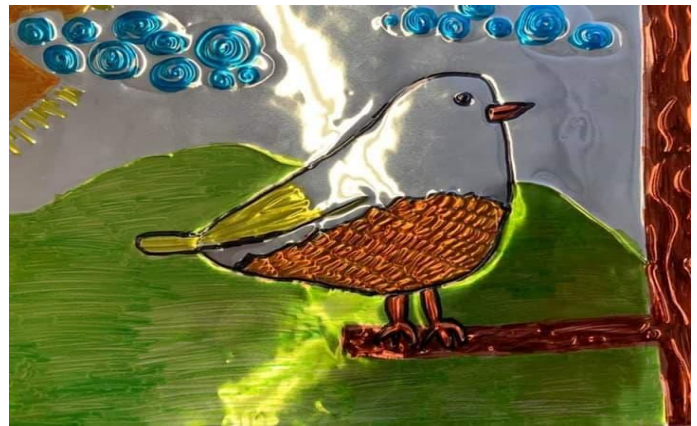
The drawings were then retraced and imprinted on thin metal sheets and painted.