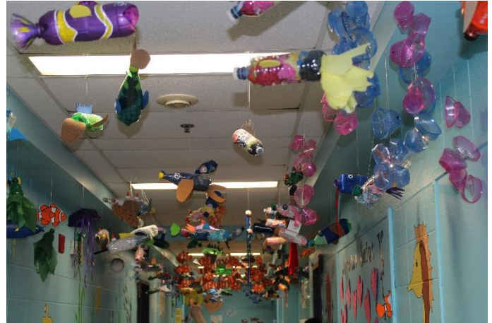
Some other fabulous artwork, using recycled water bottles to decorate the ceiling in the Kindergarten wing.