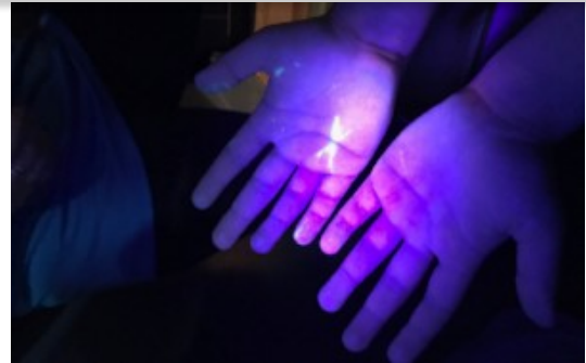
Above photo: Glo Germ test made at the Health, Justice and Social Services Caravan.