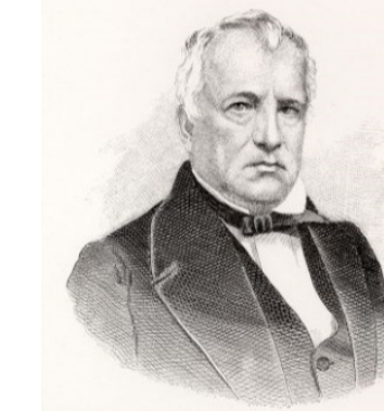
Sir L.-H. Lafontaine 1807-1864

When Papineau's rebellion failed, one of his dedicated followers, lawyer Louis-Hippolyte Lafontaine , who had been in England seeking solutions through legal means, came forward to lead the Parti des Patriotes and argued persuasively for pardons for many of the rebels. In his foundational "Adresse aux électeurs de Terrebonne" in 1840 he also made common cause with the Reform Party in Upper Canada.