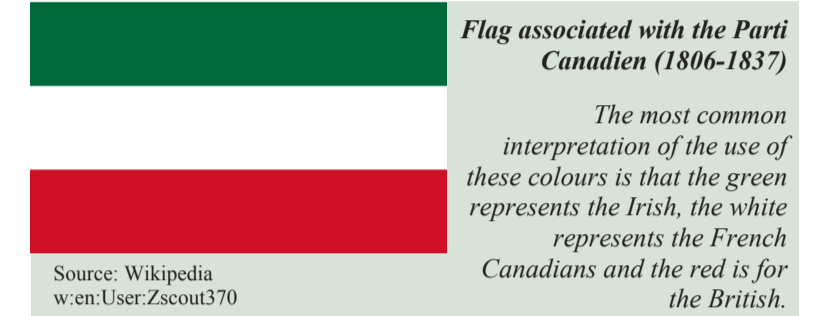
Flag associated with the Parti Canadien (1806-1837)

The most common interpretation of the use of these colours is that the green represents the Irish, the white represents the French Canadians and the red is for the British.