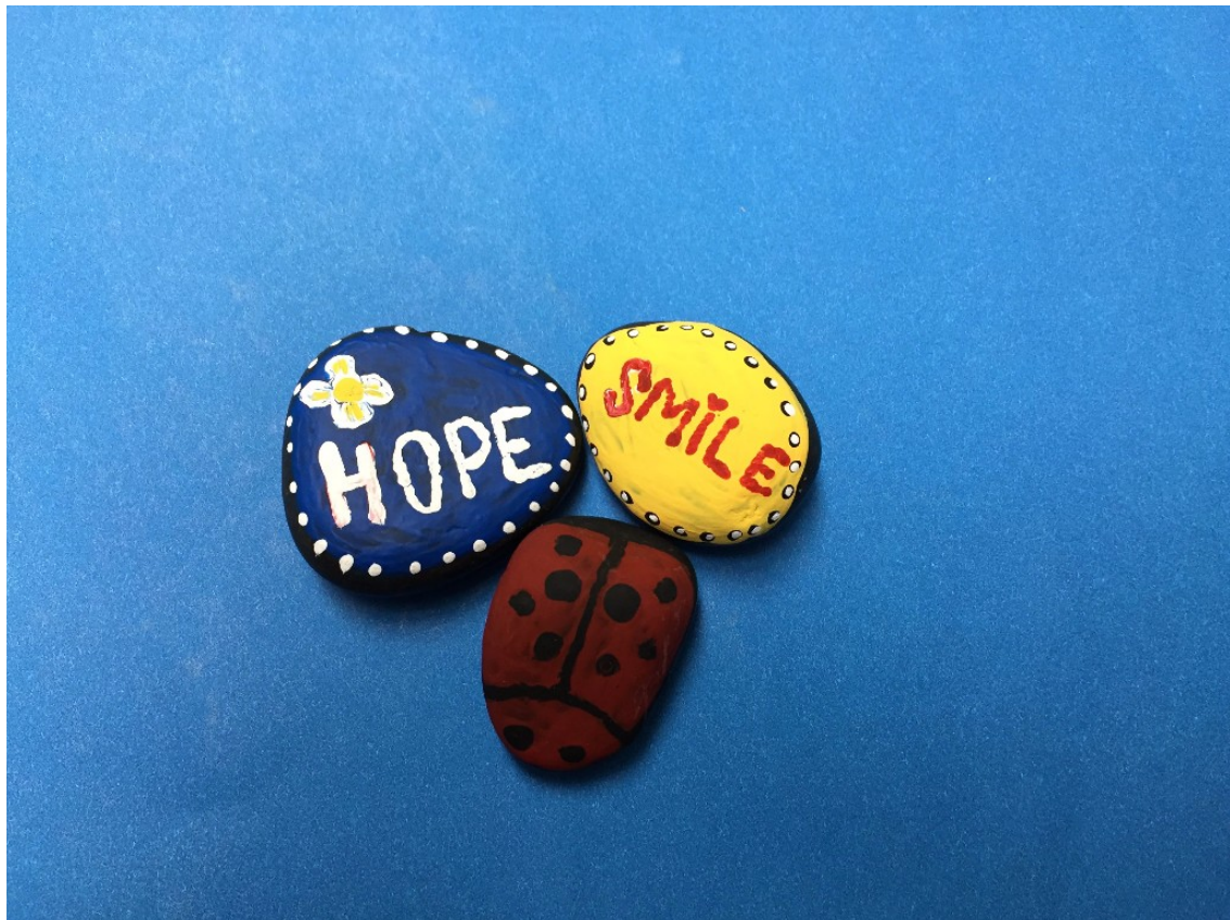
Rocks were painted as part of a 4 Korner caregivers workshop.

Please note: 4 Korner's offices will be closed on Monday May 22, 2017