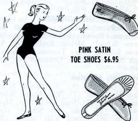
PINK SATIN TOE SHOES $6.95