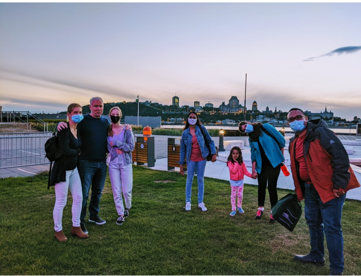
Sunset Ferry Ride, August 28