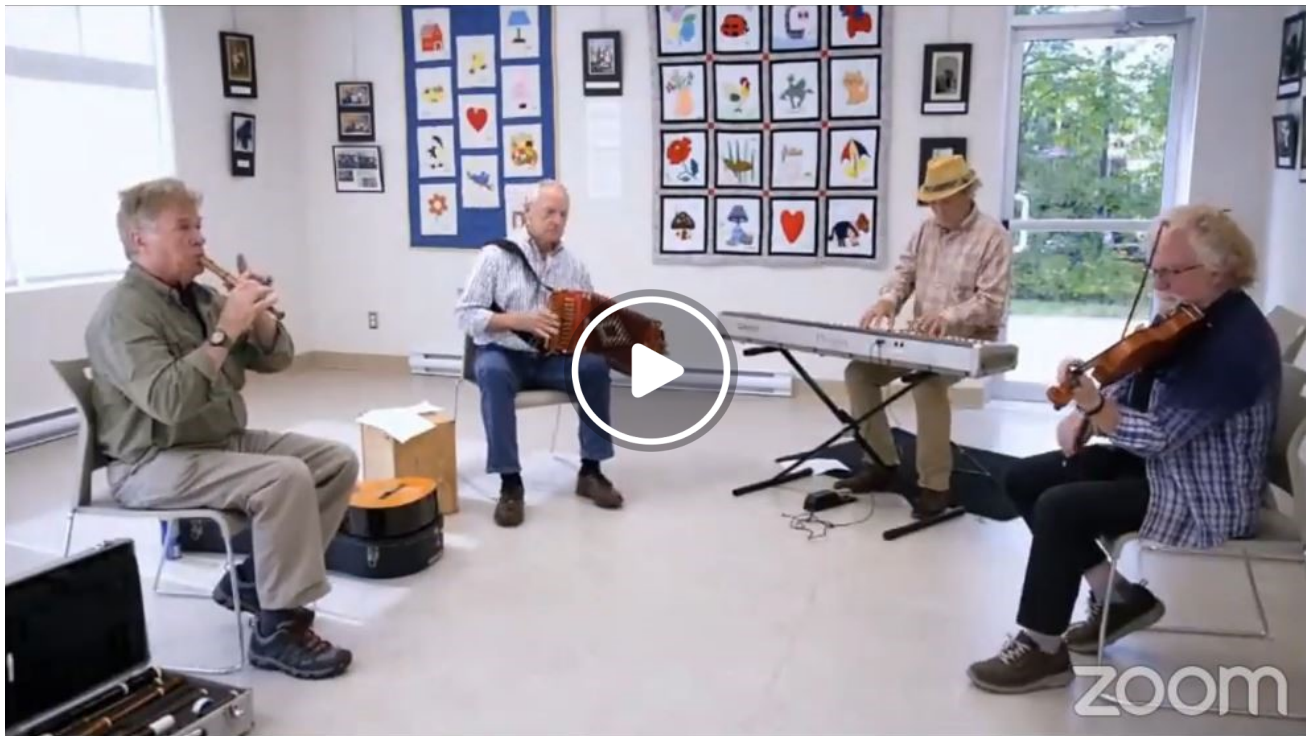
St-Patrick's in September, September 2020

VEQ was proud to collaborate with several community partners, and help sponsor the St. Patrick's Day in September event which streamed live on our Facebook page on September 19! The joint effort, spearheaded by the Quebec Anglophone Heritage Network (QAHN) , allowed us to collaborate with partners from the Catholic Women's League of Shannon , and both Historical Societies of Shannon and Valcartier , as part of a larger project entitled A Different Tune: Musical Heritage in English-Speaking Quebec .