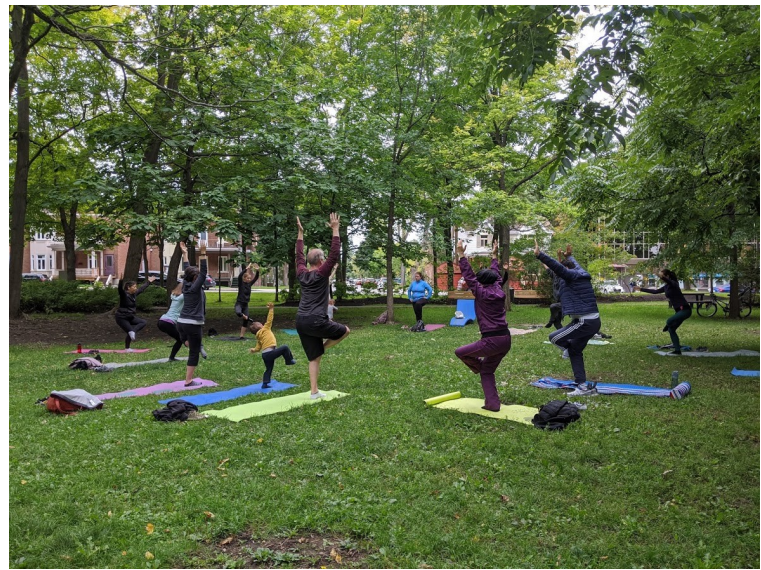
Yoga at the Park, September 13 and 17