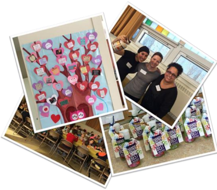
Parent volunteers at pancake breakfast on February 22, 2016, and staff appreciation week. Thank you tree made for staff appreciation week as well as thank you gifts and staff luncheon prepared and funded by Home and School.