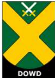
Father Dowd Foundation