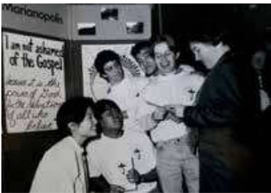
Marianopolis Catholic Action