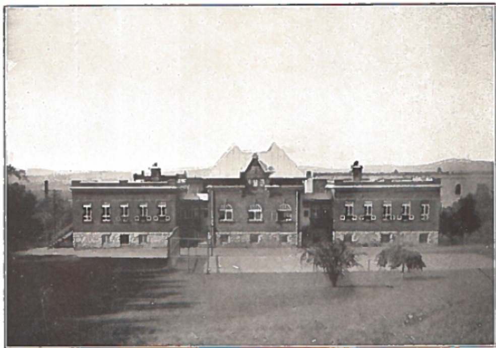
INFECTIOUS BUILDING AND TENNIS COURT