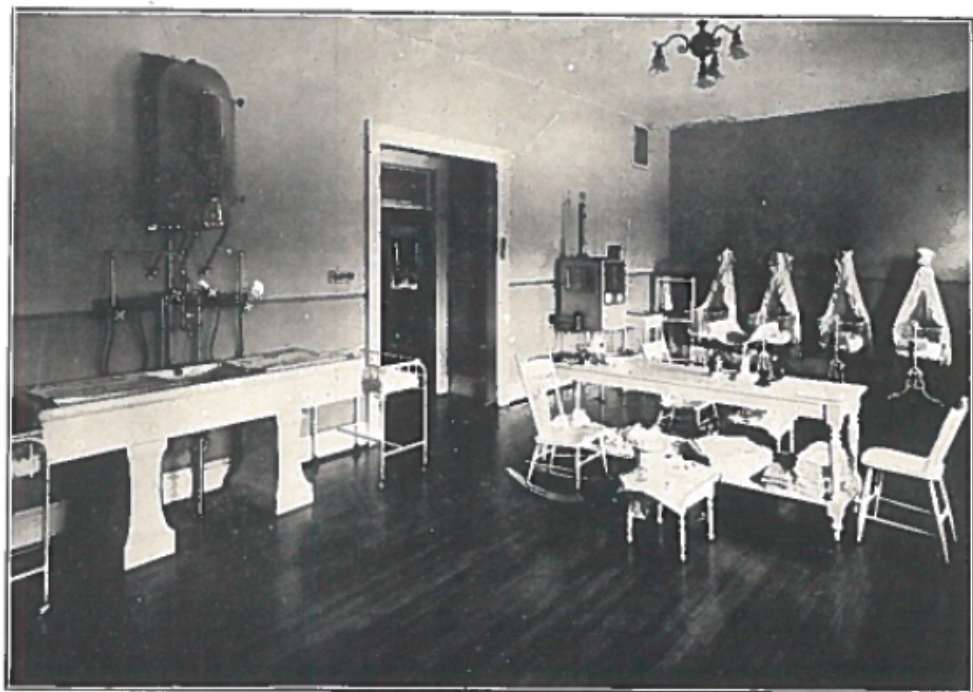
NURSERY—CAMERON MATERNITY WARDS