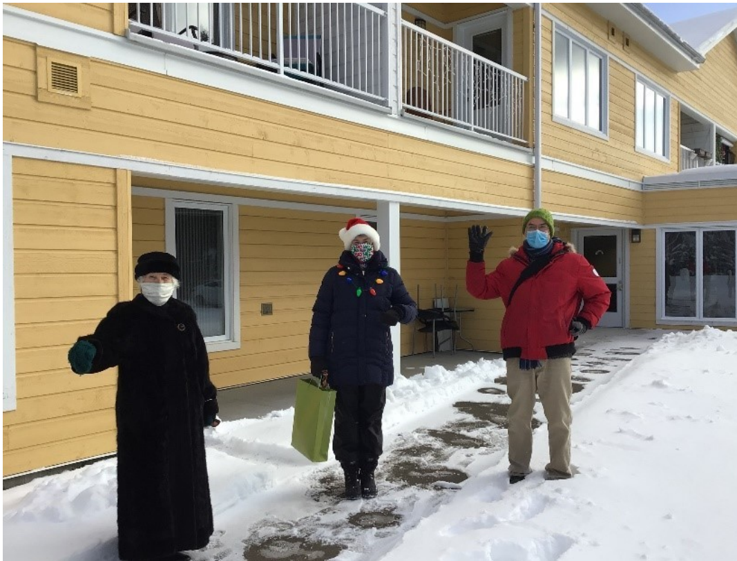
A safe outdoors Christmas carolling in December 2020.

To top it off, on December 15, all Valcartier Elementary School classes walked to a nearby residence for seniors, as well as the municipal building to perform these Christmas carols live—safely, outside and in -15°C weather! Residents of the Habitations de St. Gabriel-de-Valcartier, as well as Valcartier municipal staff, were thrilled and enjoyed this touching moment.