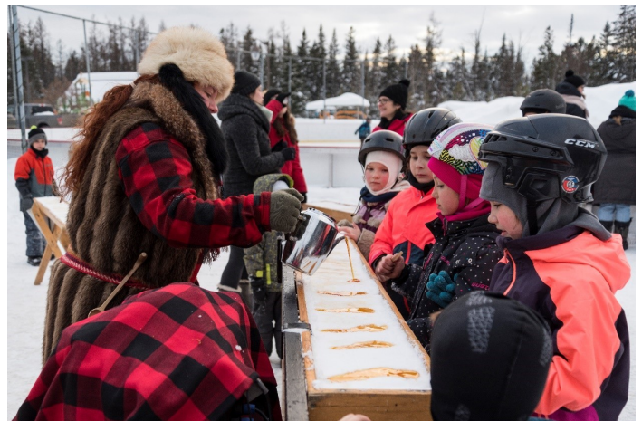
Family Skate Night in St. Gabriel-de-Valcartier, February 12, 2020 – picture courtesy of Allison Kirkwood.