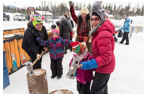
Family Skate Night in Valcartier, February 2020.