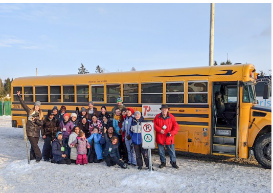
Winter Fun Excursion group outing, February 22