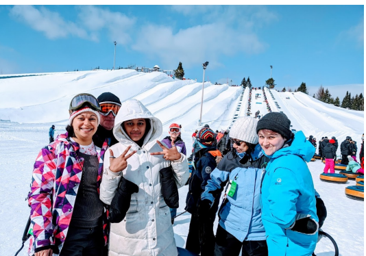
Ready to tumble down the slopes at VVV!

Financial Literacy, March: Some of the topics we'll be covering include building your credit history in Canada and its relevance, how to buy a house, what is a Registered Retirement Savings Plan (REER in French) and how it works, among others.