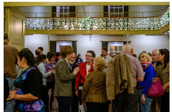
Holiday happy Hour, December 2019

VEQ will be marching proudly in the St. Patrick's Day Parade this year on March 21. We invite you to come out and join in the fun with us!