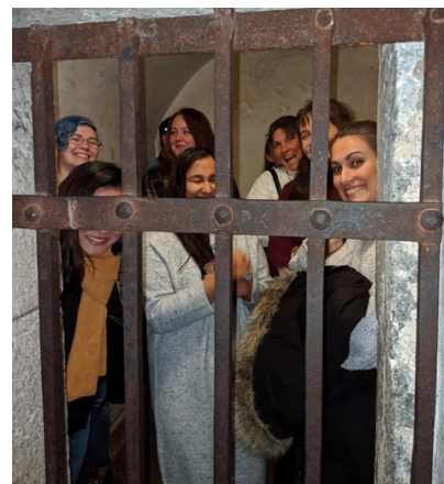
Outing at the Morrin Centre's old prison cells!

If you are new to the city or still feel like a newcomer, then join us for one of our Finding Your Niche for Newcomers events! These events are a great way to connect with other newcomers while learning about our community. Read the following page for more details!