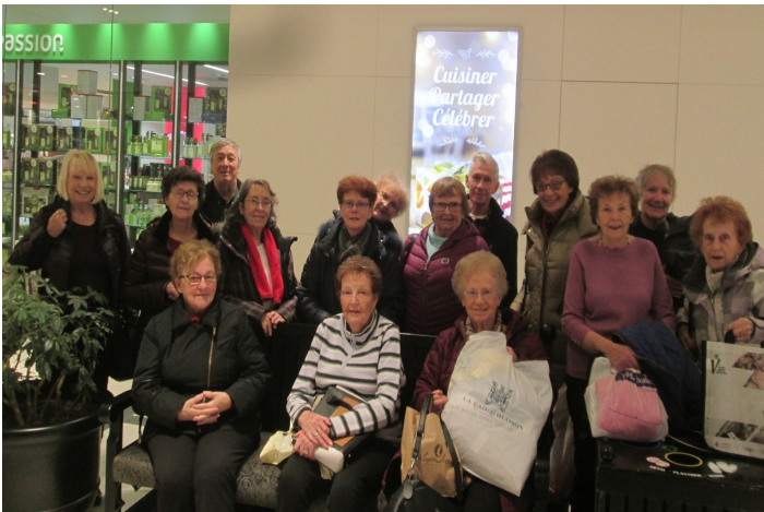
Brunch & Holiday shopping at Laurier Mall with seniors from Shannon and St. Gabriel-de-Valcartier, December 2019.

The VEQ satellite office will continue implementing current VEQ services, including community outreach and development, Newcomers' services, and acting as a hub of information for the English-speaking community.