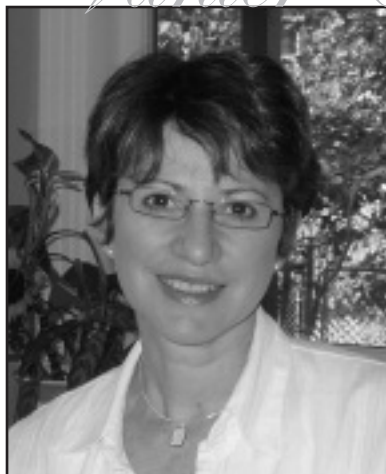
MAVIS GALLANT PRIZE FOR NON-FICTION