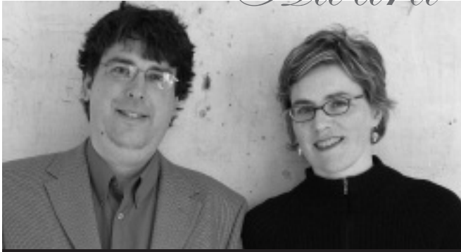
MAVIS GALLANT PRIZE FOR NON-FICTION