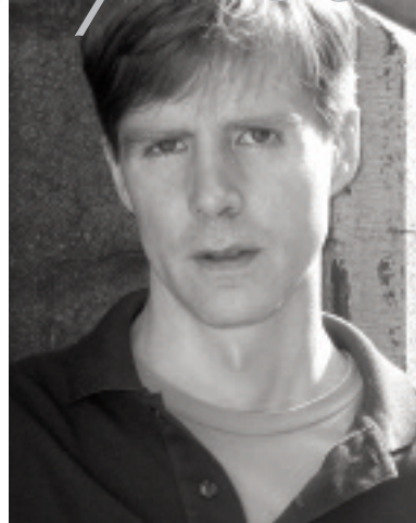
PARAGRAPH HUGH MACLENNAN PRIZE FOR FICTION