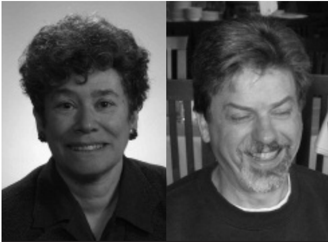
TRANSLATION PRIZE - FRENCH TO ENGLISH