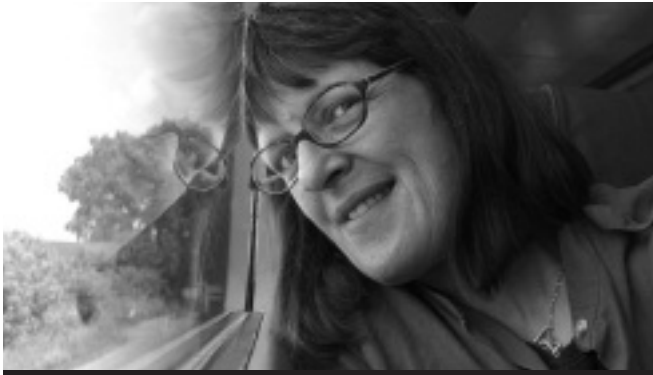
A. M. KLEIN PRIZE FOR POETRY