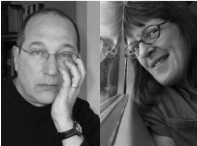
TRANSLATION PRIZE - FRENCH TO ENGLISH