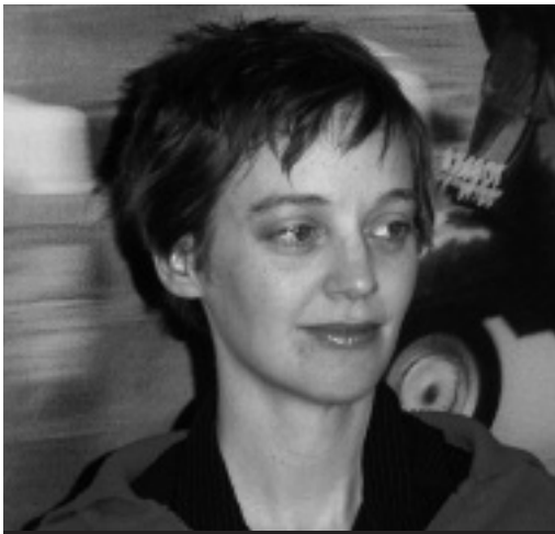
MCAUSLAN FIRST BOOK PRIZE