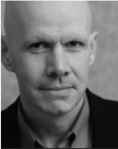
PARAGRAPH HUGH MACLENNAN PRIZE FOR FICTION