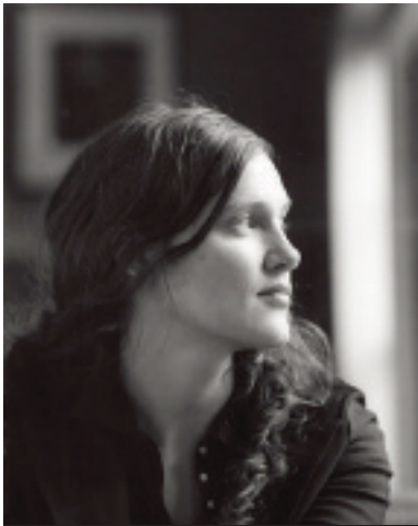
PARAGRAPH HUGH MACLENNAN PRIZE FOR FICTION