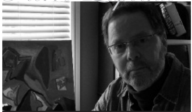
TRANSLATION PRIZE - FRENCH TO ENGLISH