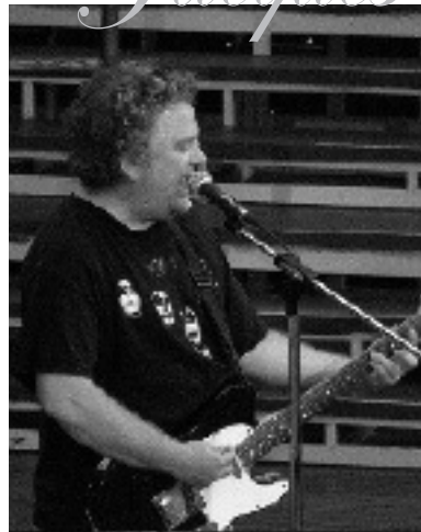
A. M. KLEIN PRIZE FOR POETRY