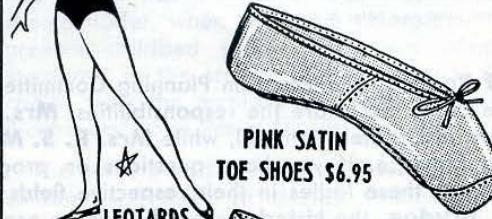
PINK SATIN TOE SHOES $6.95