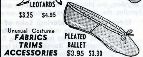
PLEATED BALLET $3.95 $3.30