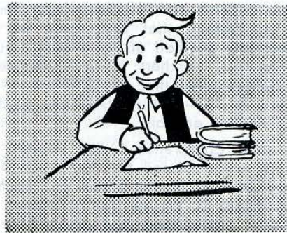
Reprinted from THE TEACHERS' MAGAZINE.

This is not fitting. Such a masterpiece, conceived in torment and delivered in agony, should stand on a velvet-covered lectern in the main foyer of the National Library.