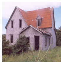
The Dingwell House

Brion Island was discovered by Jacques Cartier in June of 1534. Primarily the lighthouse keepers and the Dingwell family inhabited the island during the 1800 and 1900's. After permanent settlers deserted it, the Island became seasonally inhabited for fishing until the beginning of the 1970's.